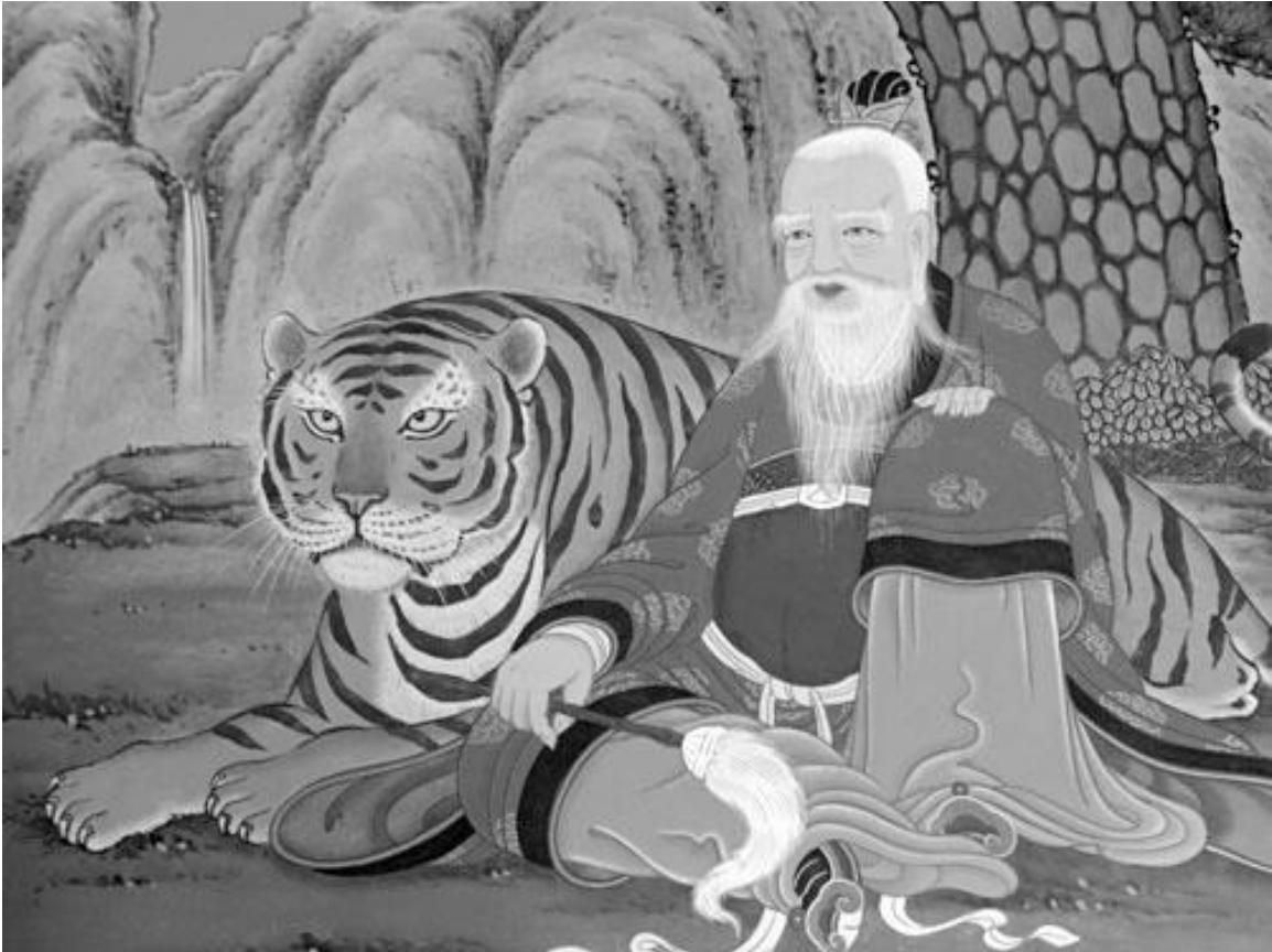
Painting of Sanshin Mountain Spirit at T'aebaeksan Gakwonsa (photo from "Sanshin: The Mountain Spirit;" see "Resources")

Look at the picture below. Work with your group to answer the questions underneath.