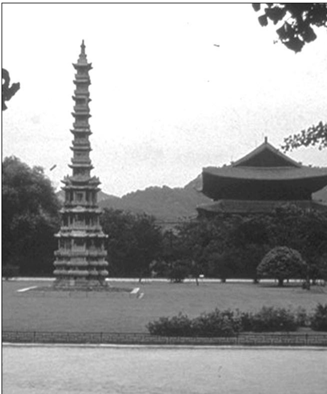
Ten-story marble pagoda at Kyongch'onsa in Kyongbok Palace (lower left). Note: This pagoda is presently located inside the new National Museum of Korea in Seoul.