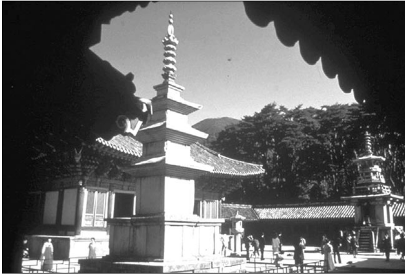
Main courtyard at Pulguksa in Kyongju, with Sokkat'ap, the Sakyamuni Pagoda, at the left (and bottom left) and Tabot'ap, the Pagoda of Many Treasures, at the right (and bottom right)