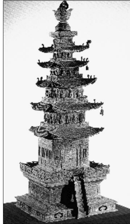
Stone pagoda with four lions at Hwaomsa on Mt. Chiri (upper left)