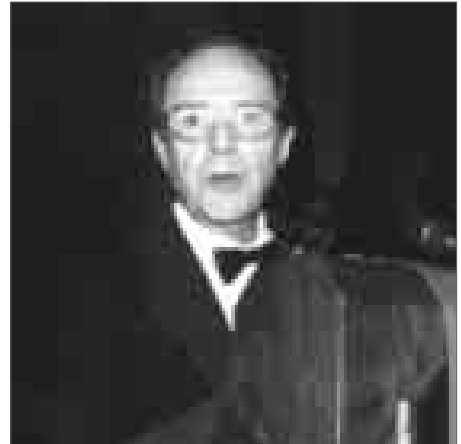
William J. Perry delivering his keynote address.