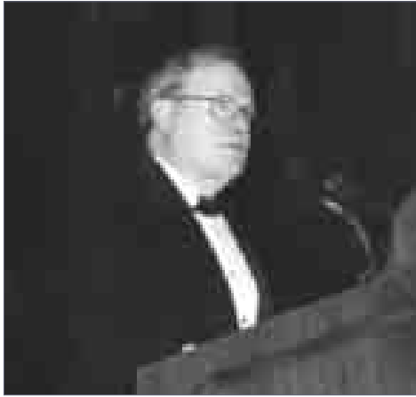
James T. Laney introducing William J. Perry.