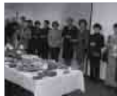
Guests at The Korea Society yearend party.