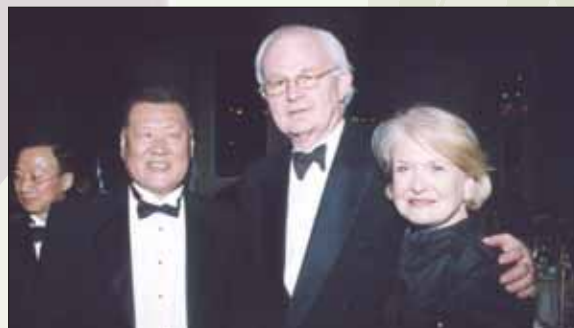
(l-r) Mr. Mong-Koo Chung, The Hon. Stephen W. Bosworth and Mrs. Christine H. Bosworth