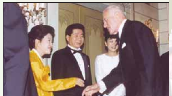
(l-r) Mrs. Roh, President Roh and Amb. Thomas S. Foley