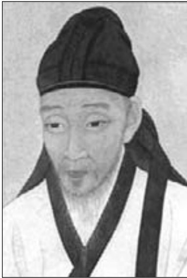
T'oege (1501-1570 CE) Confucian scholar, writer and educator