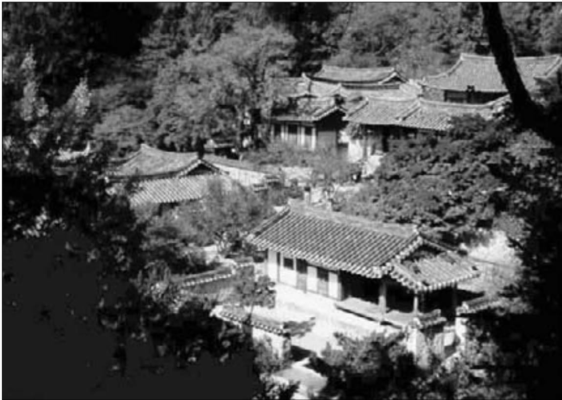
Tosan Sowon (Tosan Academy) founded by T'oege in 1557