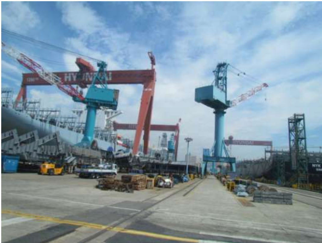
Hyundai Heavy Industries in South Korea