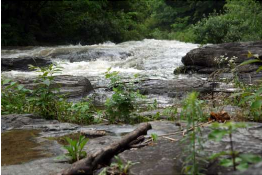
A stream in the South Korean countryside