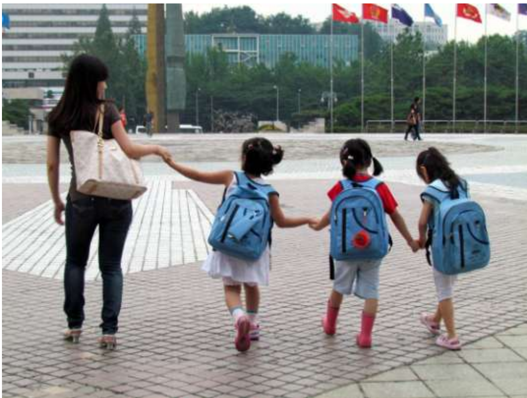
School children on a field trip in Seoul, South Korea