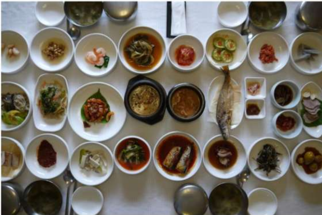
A Korean table setting