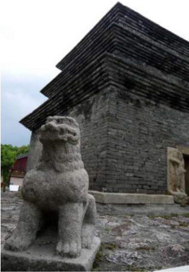
A stone pagoda in the southern part of the Korean Peninsula