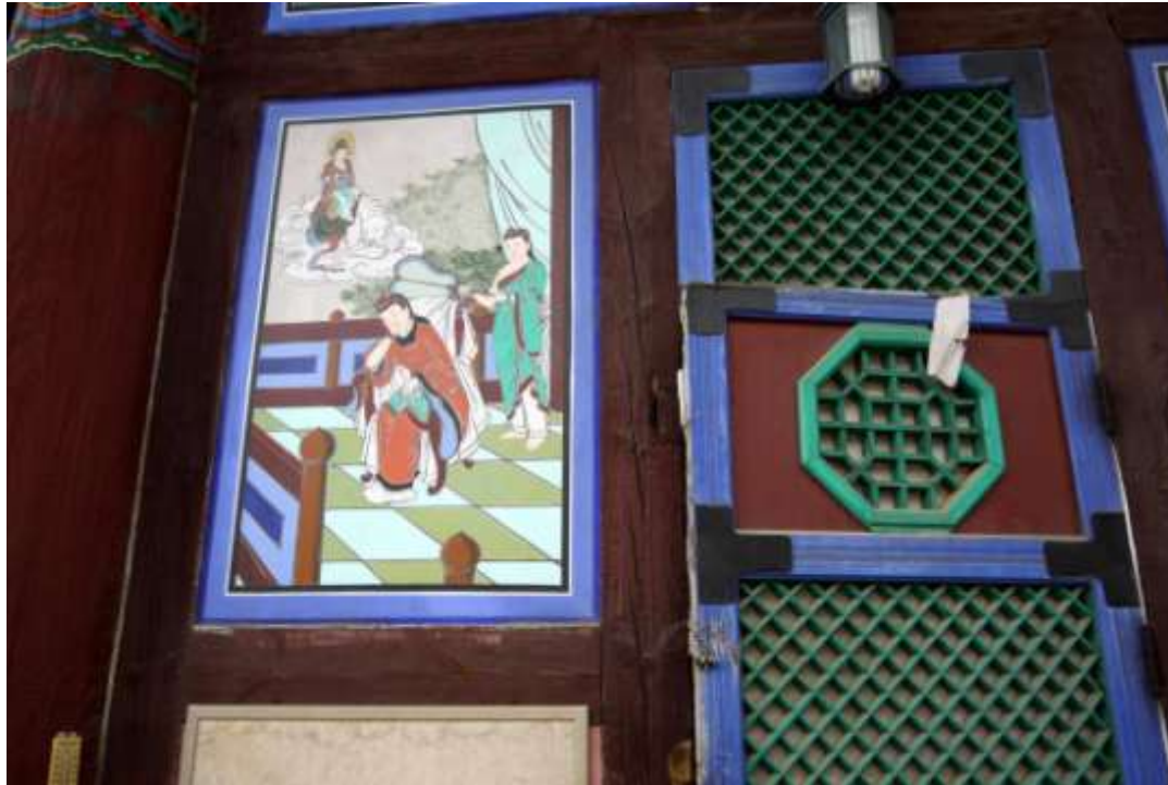
Paintings at a Buddhist temple in the southern part of the Korean Peninsula