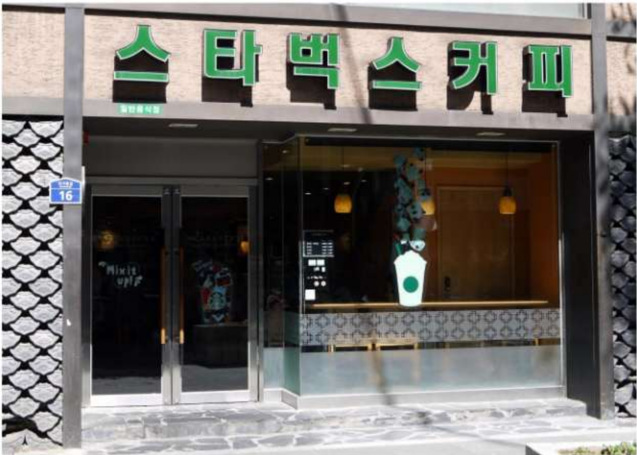
A Starbucks in Hangju