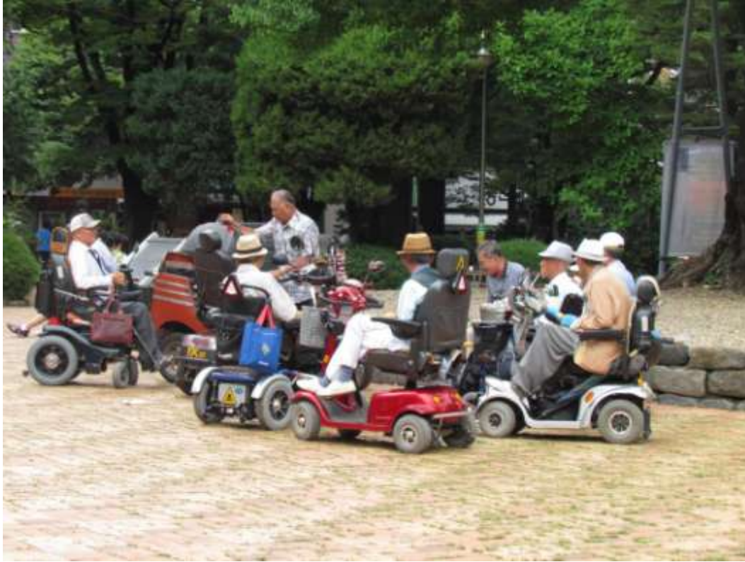
A gathering of elderly men at a park in the southern part of the Korean Peninsula