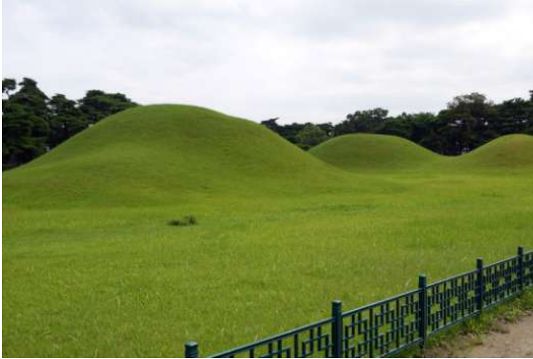
Ancient royal tombs in the southern part of the Korean Peninsula