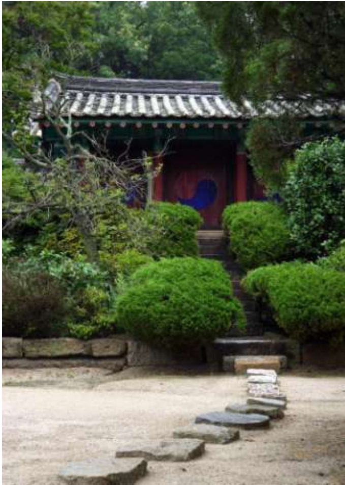
The yin and yang sign on a door in a Korean village