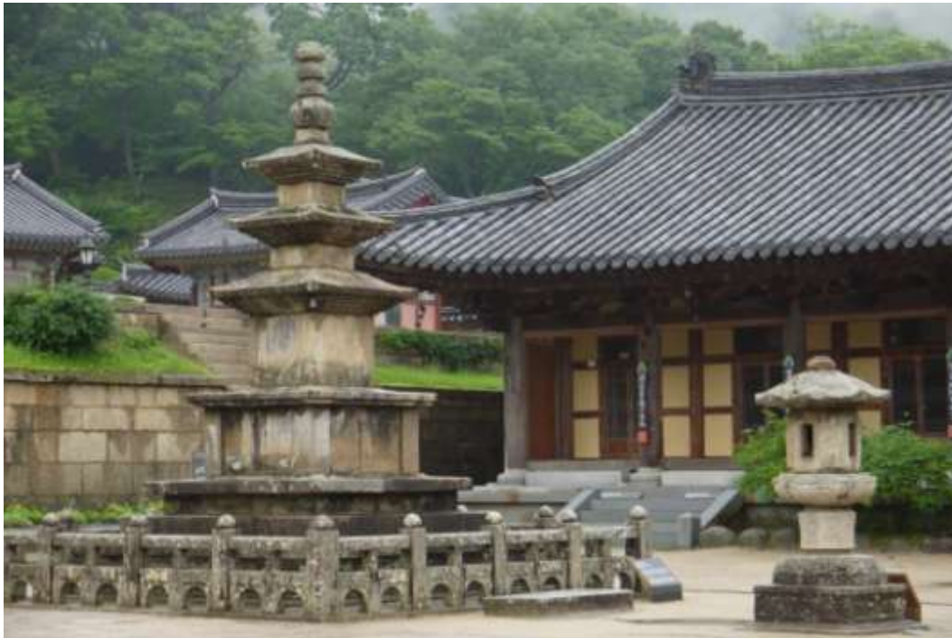
A Buddhist temple in the southern part of the Korean Peninsula