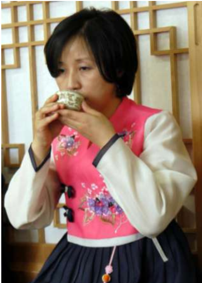
A Korean woman wearing the hanbok participates in a tea ceremony