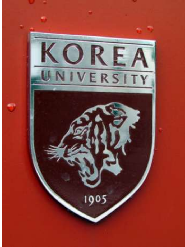
The emblem for Korea University in Seoul, South Korea