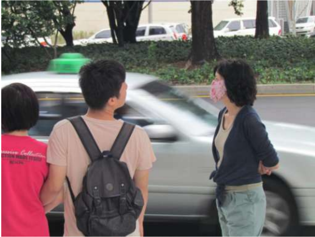
A Korean woman wears a face mask to protect herself from pollution