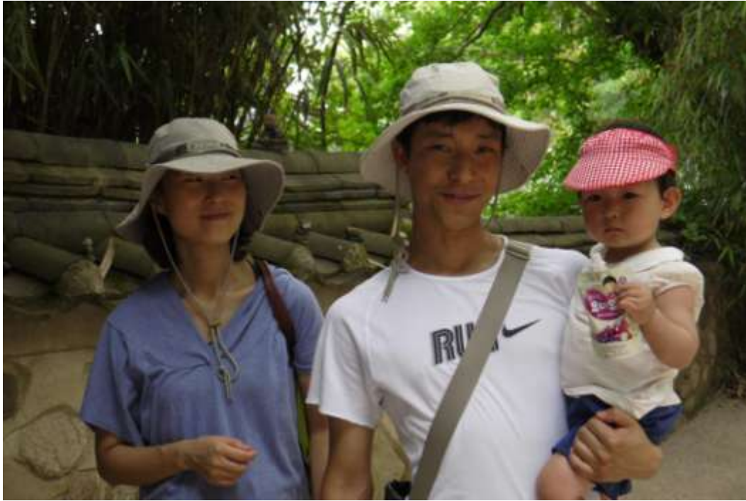
A Korean family