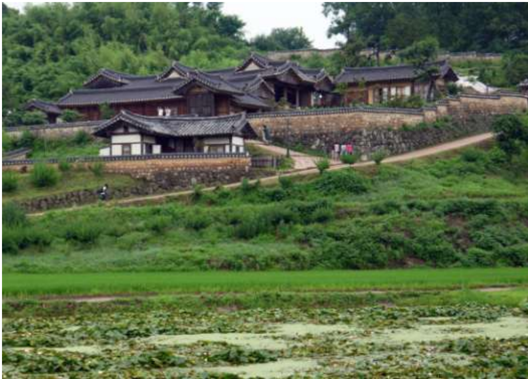
The village of Yang Dong in the southern part of the Korean Peninsula