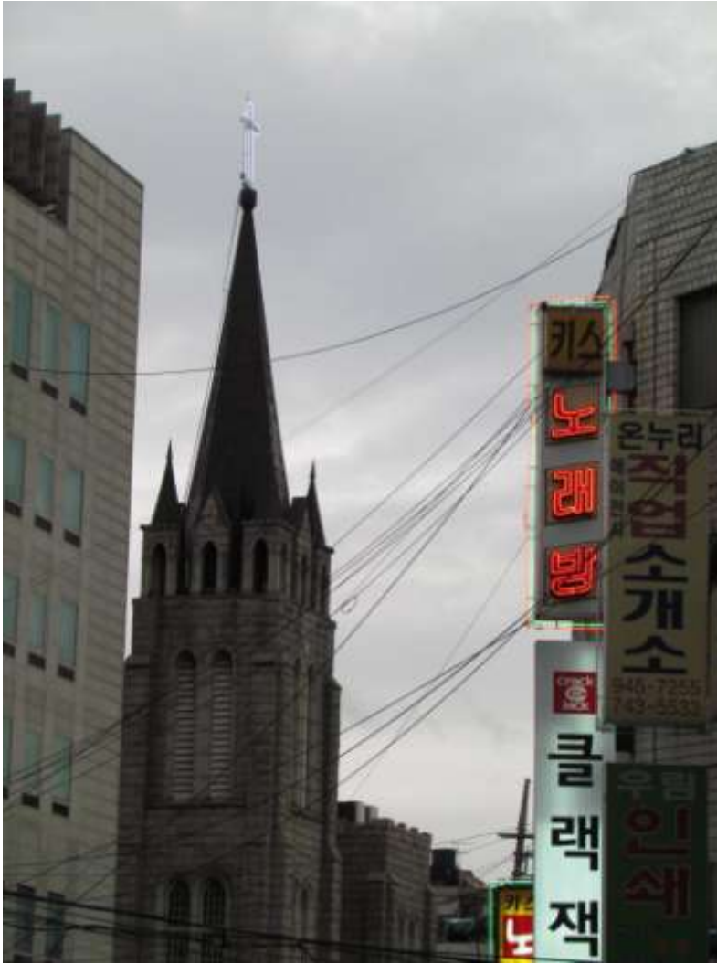
A Christian church in Seoul,