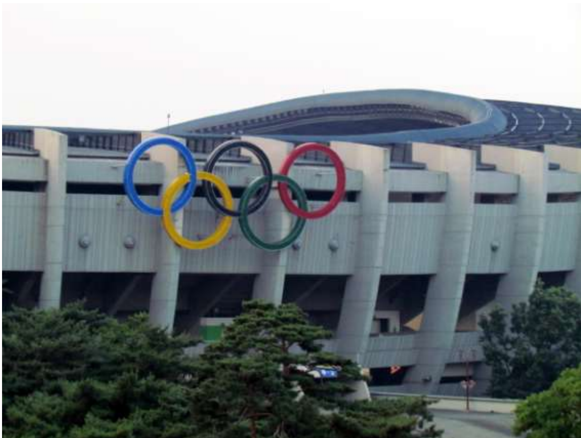
The Olympic Stadium in Seoul, South Korea