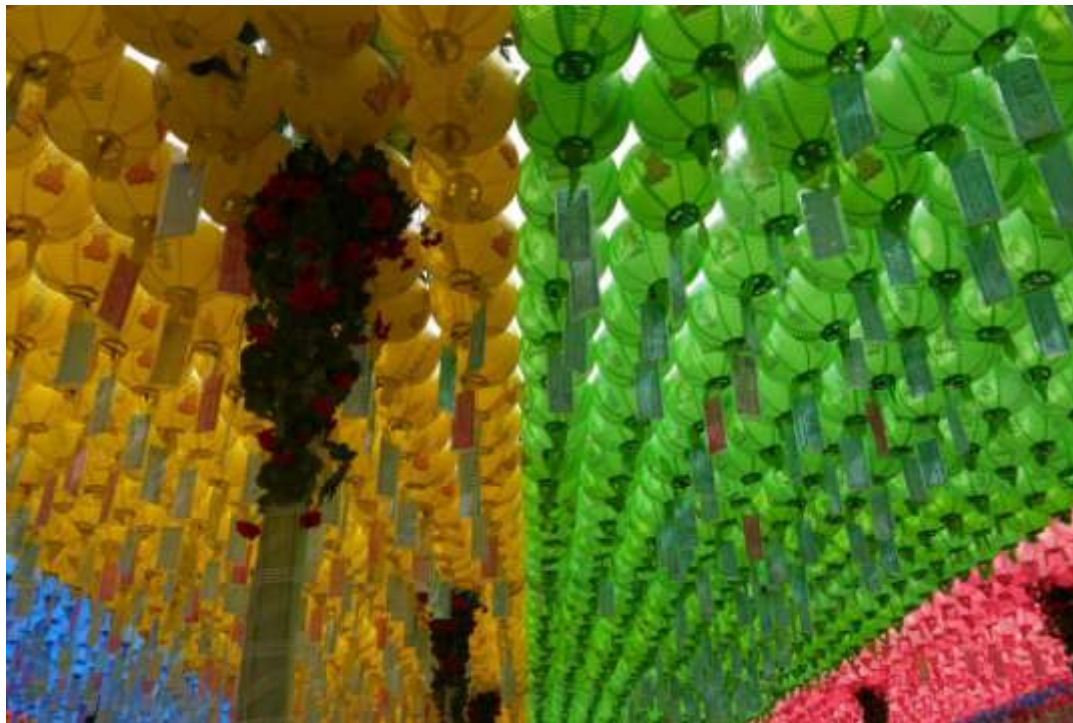
Numerous lanterns hanging at a Buddhist temple in the southern part of the Korean Peninsula