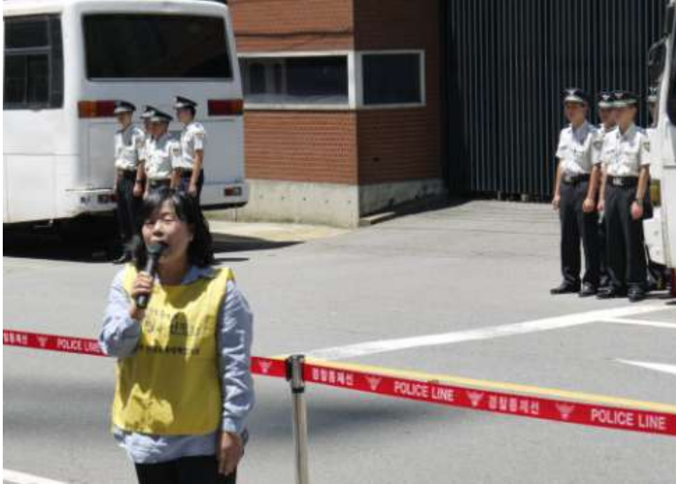
A Korean woman and police officers in front of the Japanese Embassy in Seoul, South Korea, to protest the Japanese treatment of Koreans during occupation