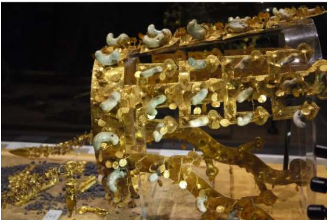
An ancient royal crown in Korea