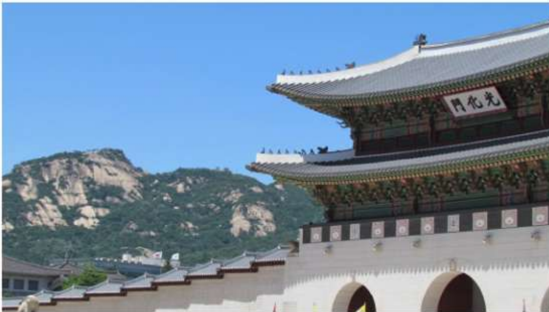
The gate to an ancient palace in Seoul South Korea