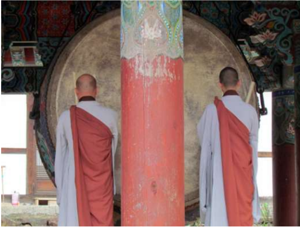
Two Buddhist monks play the drum at a temple