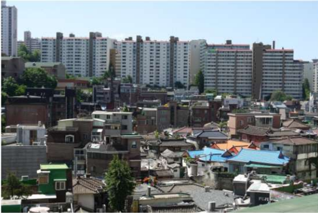
Buildings in modern Seoul South Korea