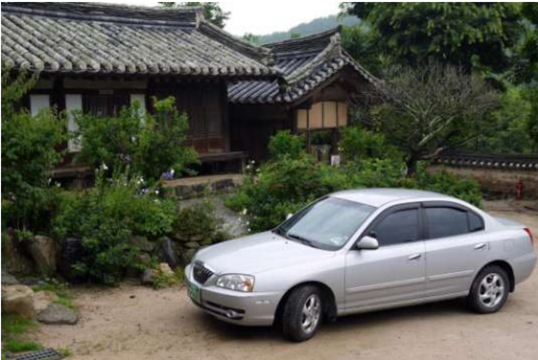
A home in a village in the southern part of the Korean Peninsula