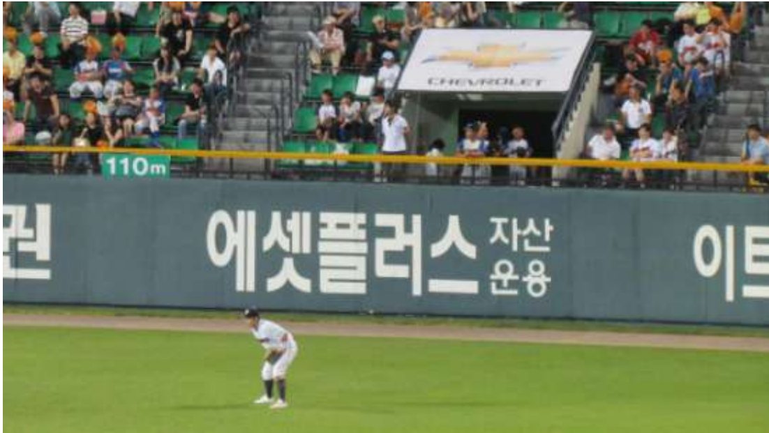
A professional baseball game in Seoul, South Korea