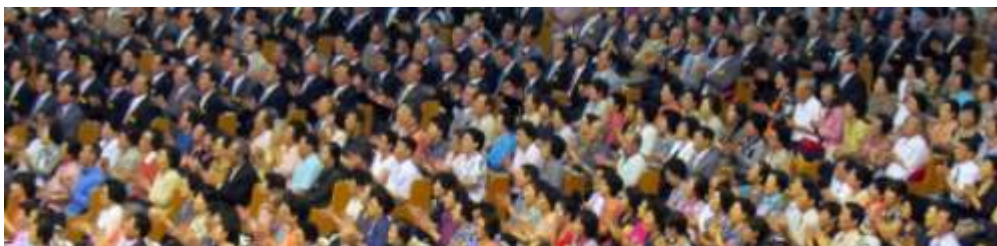
The congregation at the Yoido Full Gospel Church, the world's