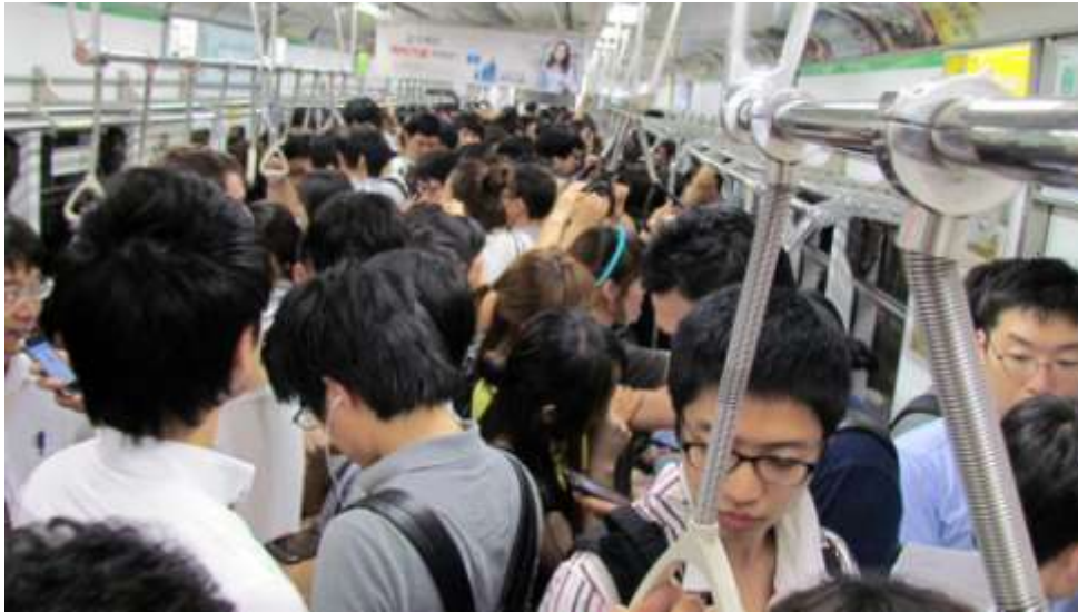
A crowded subway train in Seoul, South Korea