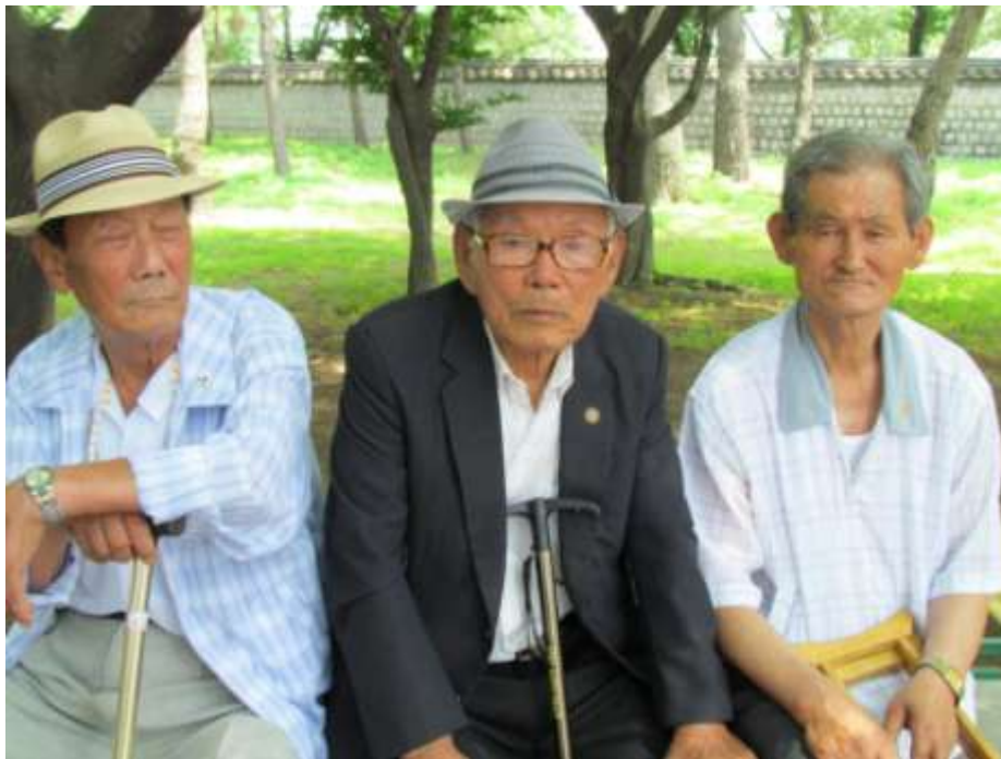
Three elderly men relaxing at a park in the southern part of the Korean Peninsula