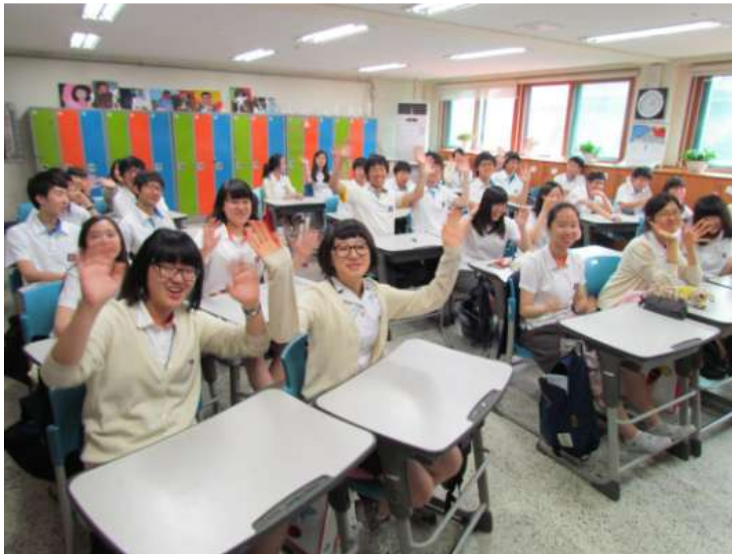
High school students in a private school in Seoul, South Korea