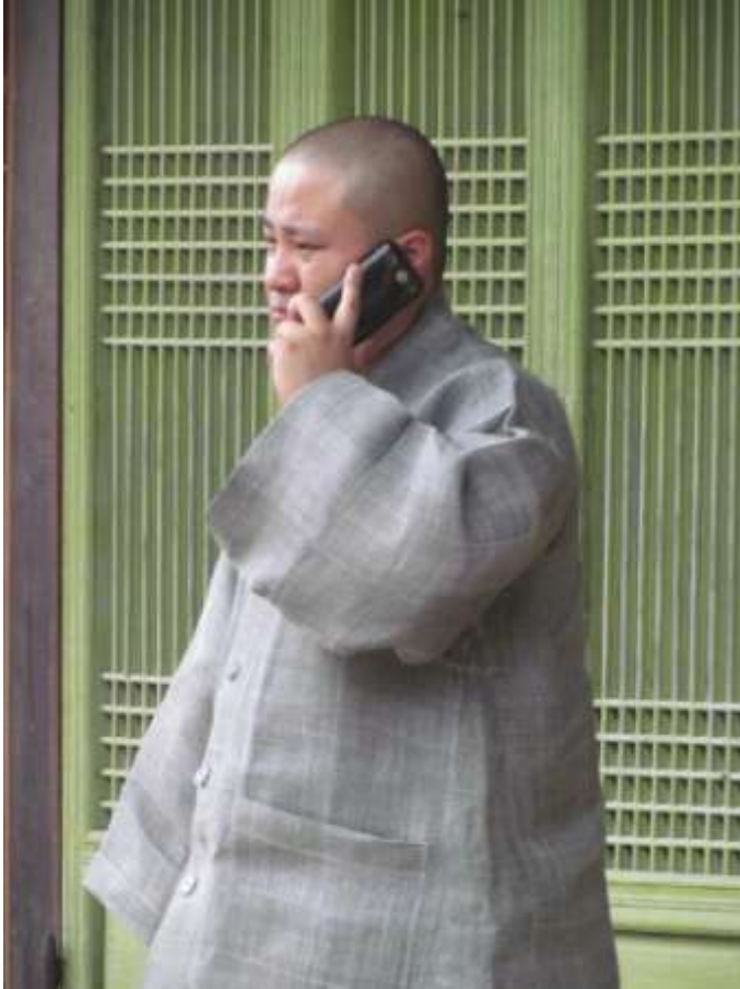
A monk talks on a cell phone at a Buddhist temple in the southern part of the Korean Peninsula