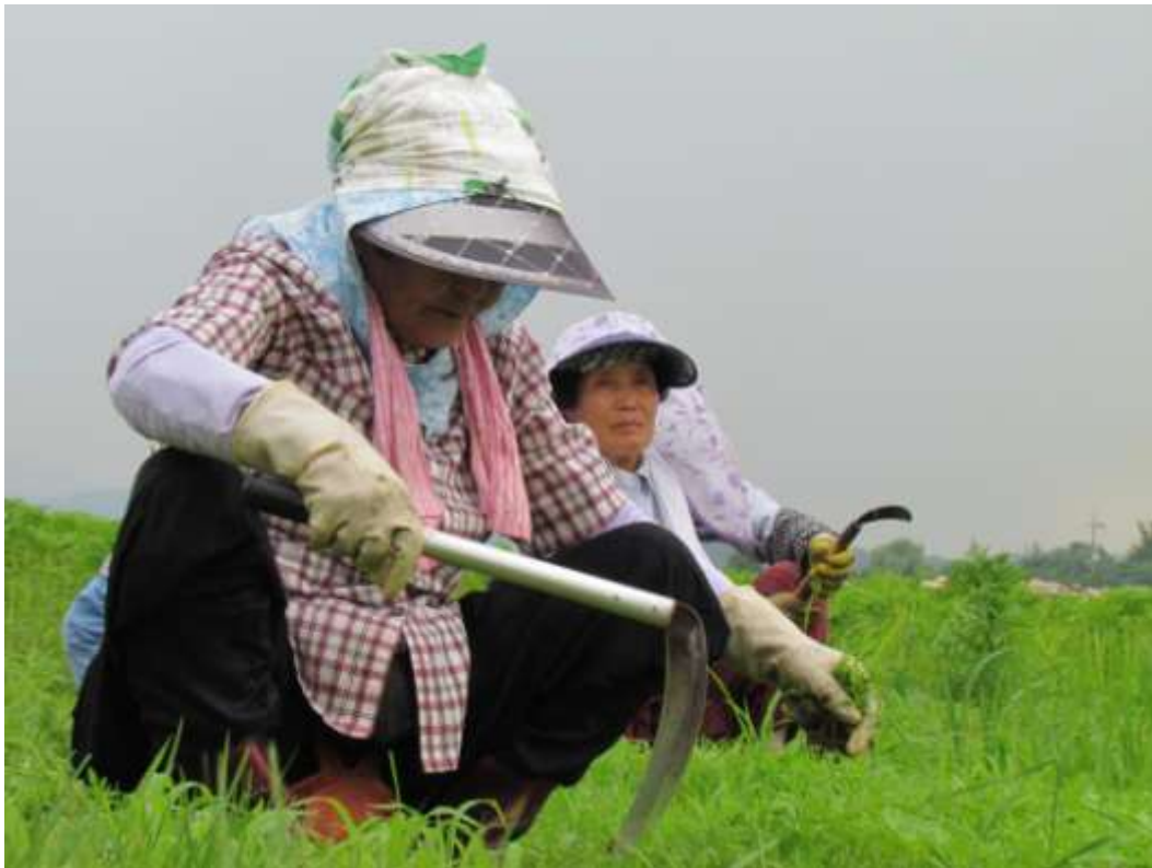
Korean women working in the field of the South Korean countryside