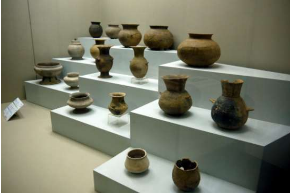
Ancient Korean pottery