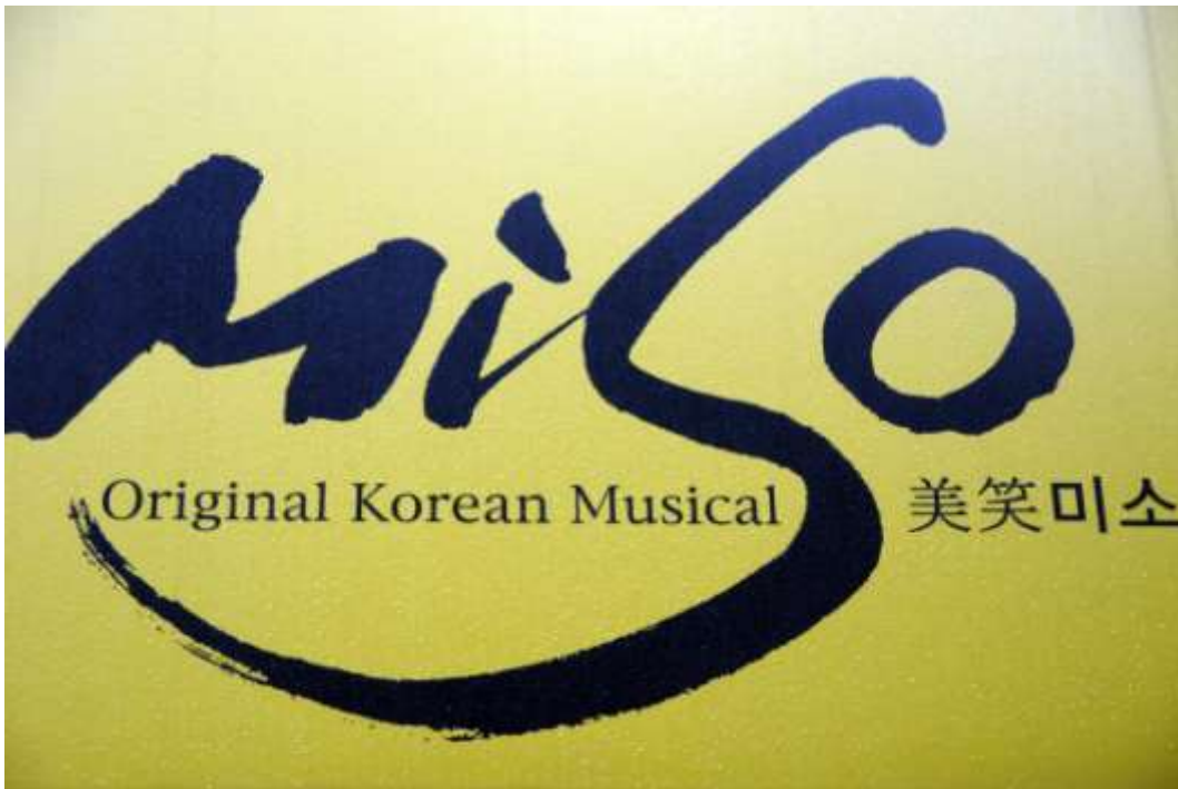
A sign advertising a Korean musical performance in Seoul, South Korea