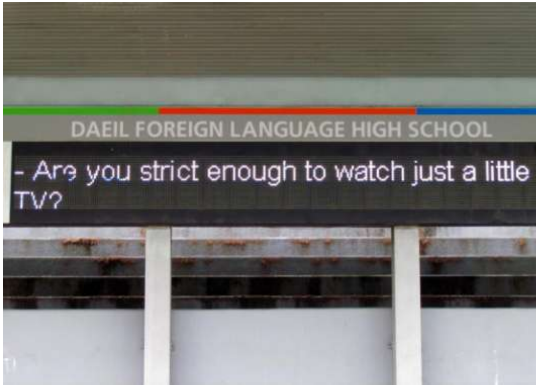
The sign outside of a high school in Seoul, South Korea