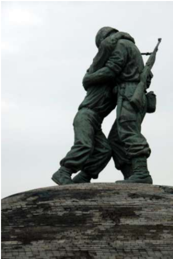
A statue in Seoul, South Korea, to symbolize a reunified Korean Peninsula