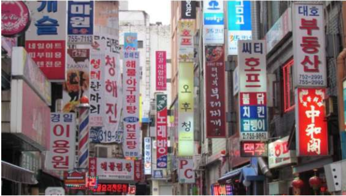
A street in Seoul, South Korea