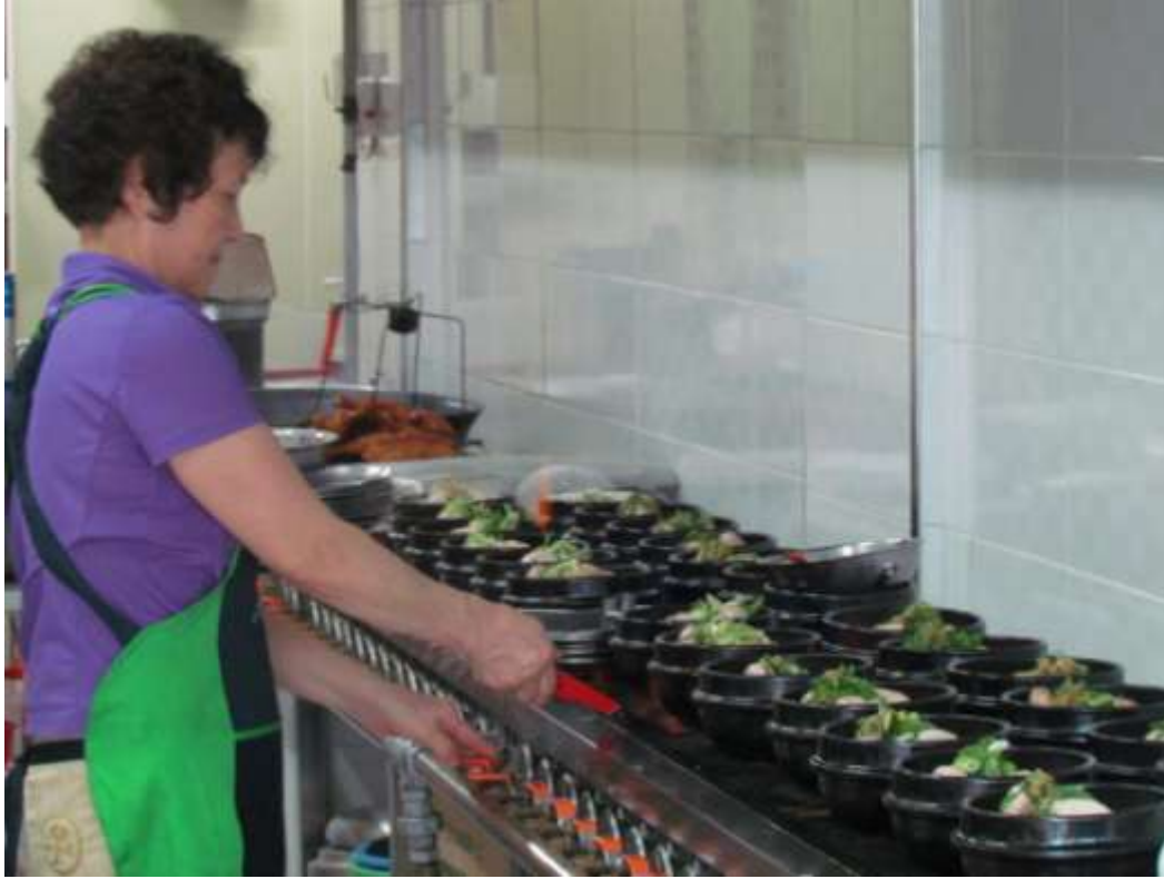
A Korean woman prepares ginseng chicken soup