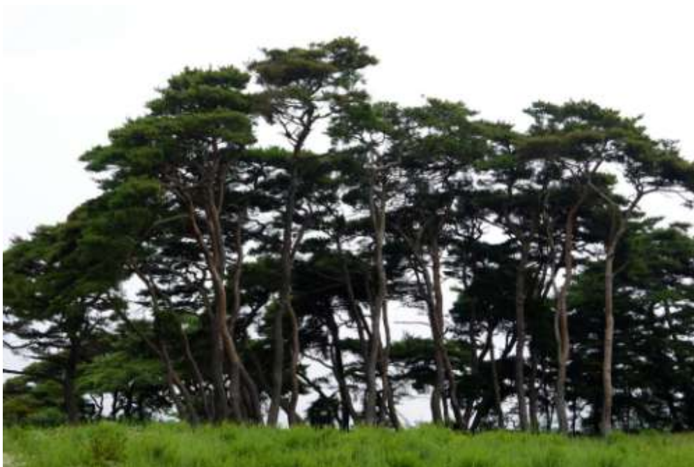
Trees at an archeological site in the southern part of the Korean Peninsula