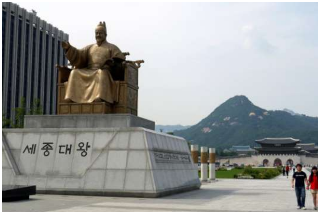
A statue of Sejong the Great, the creator of Hang'ul