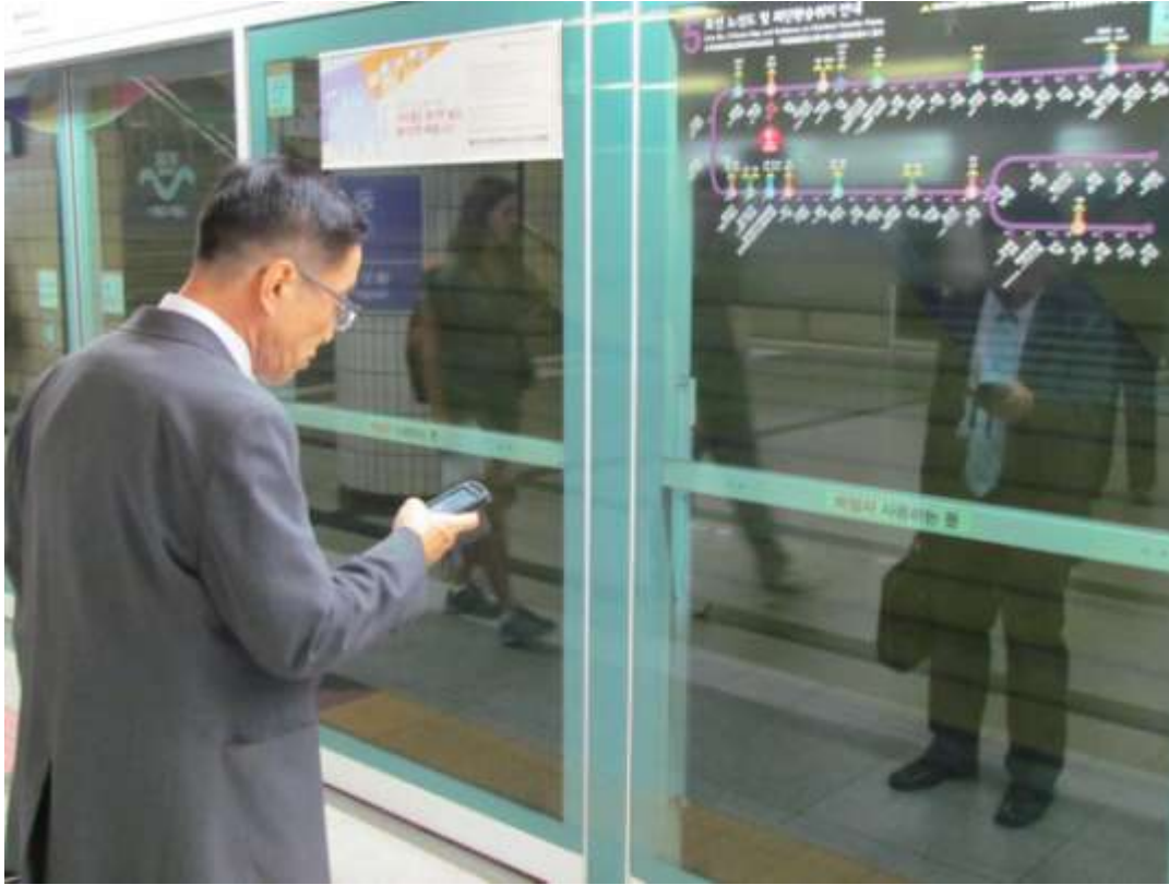
A Korean man uses his cell phone while waiting for a subway train in Seoul, South Korea