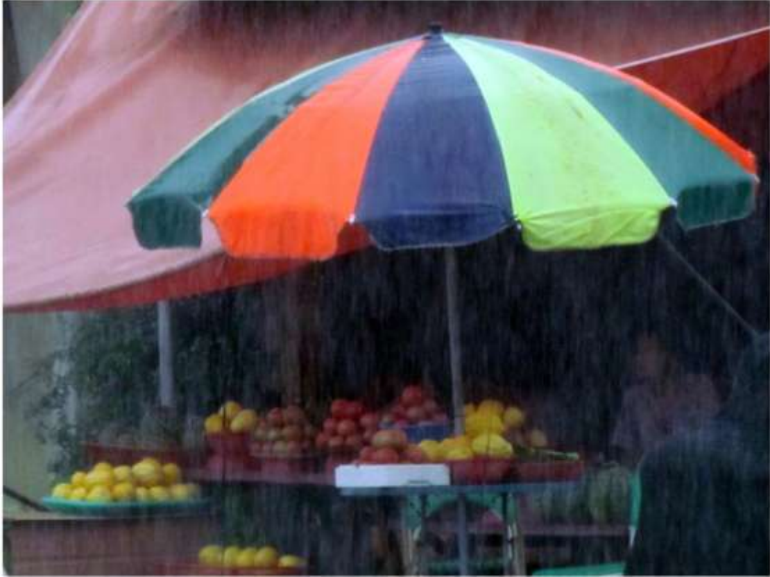
A produce vendor in the monsoon rains of a Korean summer