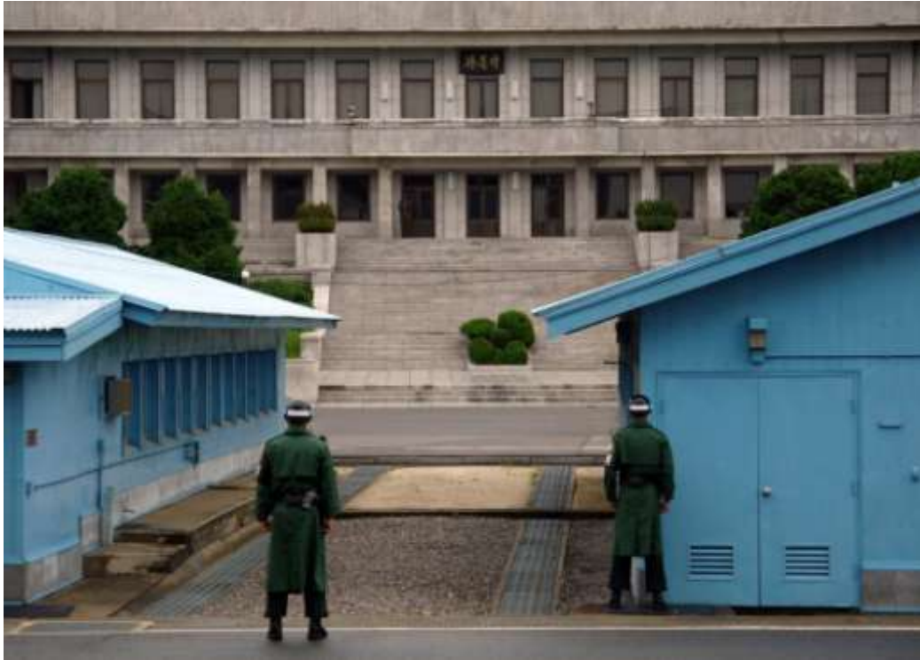
The border of North Korea and South Korea in the Demilitarized Zone