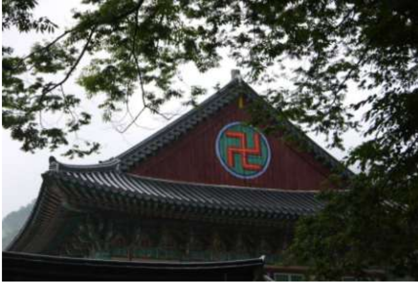
A swastika at the site of a Buddhist temple

Photograph to use during the delivery of the content: