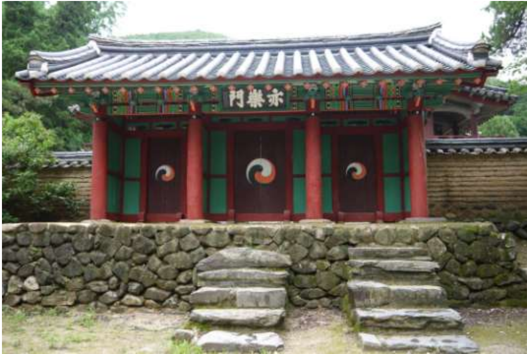
A Confucian school in the southern part of the Korean Peninsula