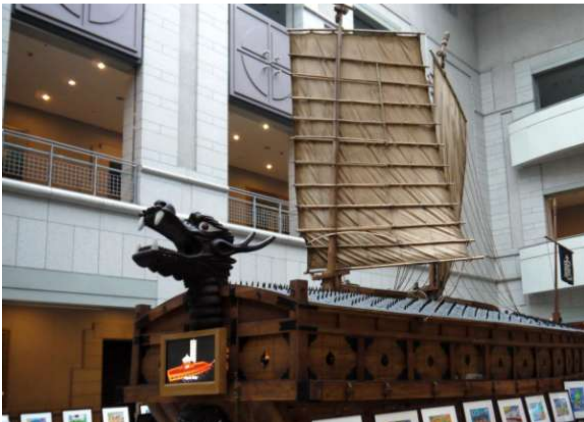
A turtle ship