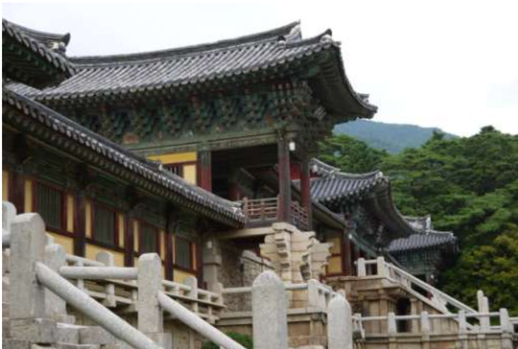
A Buddhist temple in the southern part of the Korean Peninsula