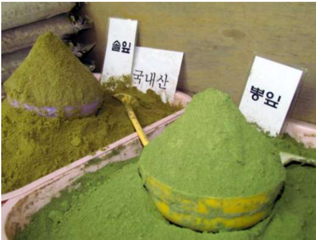
Spices for sale in Korea