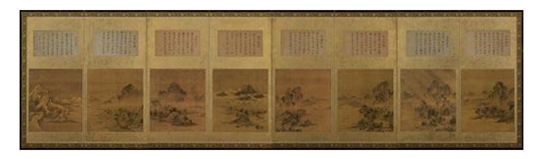
Eight Views of the Xiao and Xiang Rivers , 16th century Eight hanging scrolls; ink on paper; each panel 35 13/16 x 18 3/4 in. (91 x 47.7 cm) Jinju National Museum of Korea, Gift of Kim Yongdu (Jinju 6330)

These eight scrolls present an almost panoramic view of the famous site, filtered through changing seasons. In this set, as in other extant scrolls, the vertical format enables a clear articulation of the tripartite composition of fore-, middle-, and background, standard in early Joseon paintings on this theme. Each scene conveys simultaneously compositional coherence, expansiveness, and depth. The landscapes overall are both intimate and majestic. The eight scenes, from right to left, are: Mountain Market, Clear with Rising Mist; Evening Bell from Mist-Shrouded Temple; Fishing Village in Evening Glow; Returning Sail off Distant Shore; Night Rain on Xiao and Xiang; Autumn Moon over Lake Dongting; Wild Geese Descending to a Sandbar; River and Sky in Evening Snow.