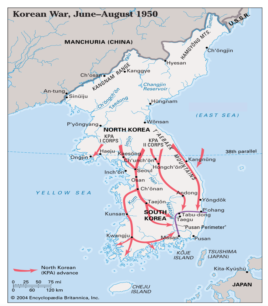
"Korean War: June–August, 1950". Map. Encyclopædia Britannica Online . Web. 09 Aug. 2012. <a href="http://www.britannica.com/EBchecked/media/70868/">http://www.britannica.com/EBchecked/media/70868/></a>

1a. According to Document 1, what action did North Korea take between June and August of 1950?