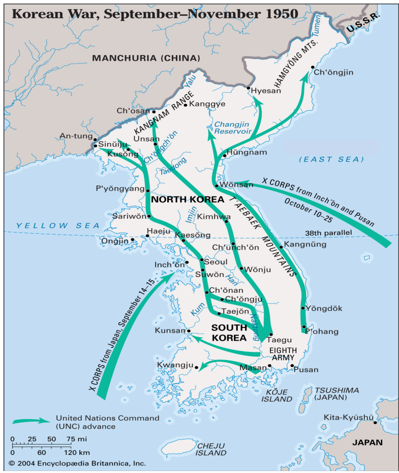
"Korean War: September–November, 1950". Map. Encyclopædia Britannica Online . Web. 09 Aug. 2012. <a href="http://www.britannica.com/EBchecked/media/70874/">http://www.britannica.com/EBchecked/media/70874/</a>

1b. According to Document 1b, how did the United Nations Command react to North Korea's action?