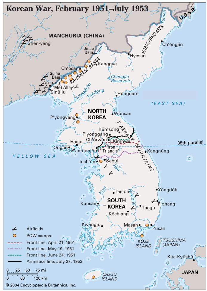
"Korean War: February 1951–July 1953". Map. Encyclopædia Britannica Online . Web. 09 Aug. 2012. <a href="http://www.britannica.com/EBchecked/media/70876/">http://www.britannica.com/EBchecked/media/70876/</a>