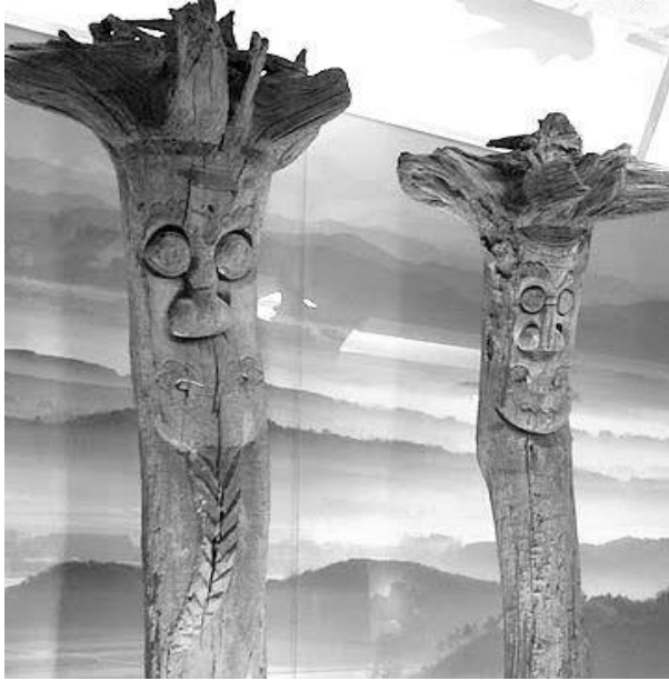
Picture #1: wooden village guardians at The National Folk Museum of Korea in Seoul

Look at pictures below. Work with your group to answer the questions underneath.