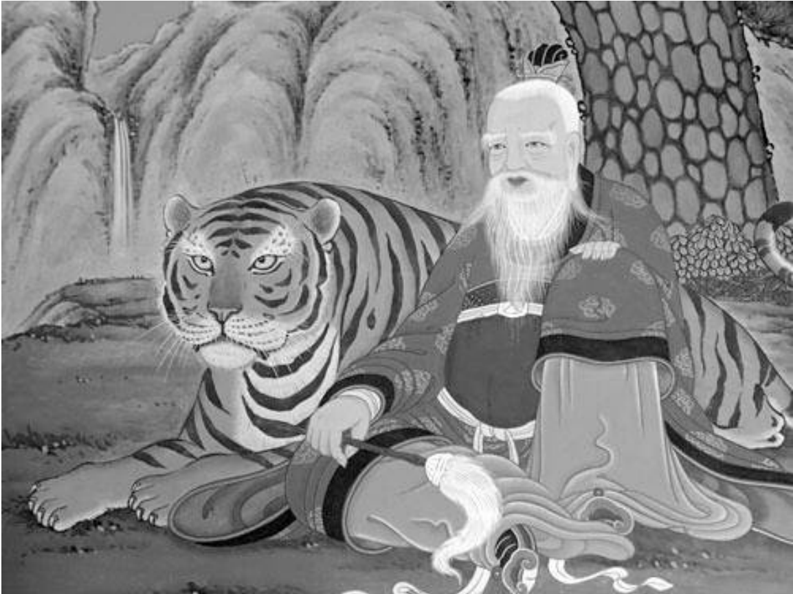
Painting of Sanshin Mountain Spirit at T'aebaeksan Gakwonsa

Look at the picture below. Work with your group to answer the questions underneath.